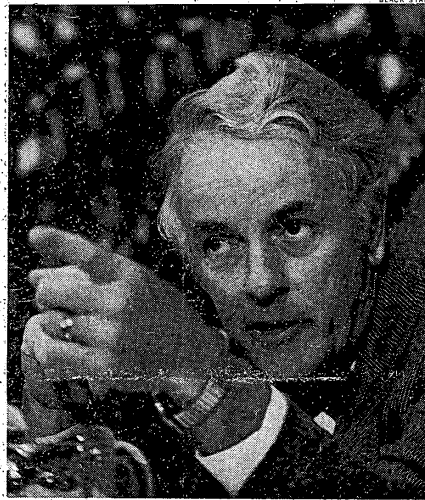
House Select Committee Chairman Otis Pike: He got the "dribble treatment"—one or two documents a day.

14 The last two pages of one set of documents were typical deletions. The first page was apparently a cable. It was blank, except for the following across the top: 3/ND/DOLL-VNM/T-0144-6SG TRANS