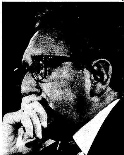
Secretary Kissinger: He was "alleging a privilege heretofore reserved only to presidents."

The deletions came in all shapes and forms. Typically, there would be one line left on a page, say—