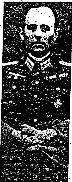
Reinhard Gehlen, former West German intelligence chief, in World War II.

An announcement is expected this week that bids for the world rights to the manuscript outside Germany have been made by the World Publishing Company, a subsidiary of the Times Mirror Company of Los Angeles, and Avon Books, a paperback publisher owned by the Hirst Corporation. The publishing house of William Collins of London is also known to have offered $100,000 for the rights.