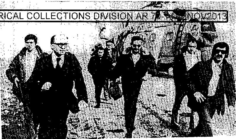
Prime Minister Begin arrives in southern Lebanon

The Egyptians probably hope their tough line will help generate a serious