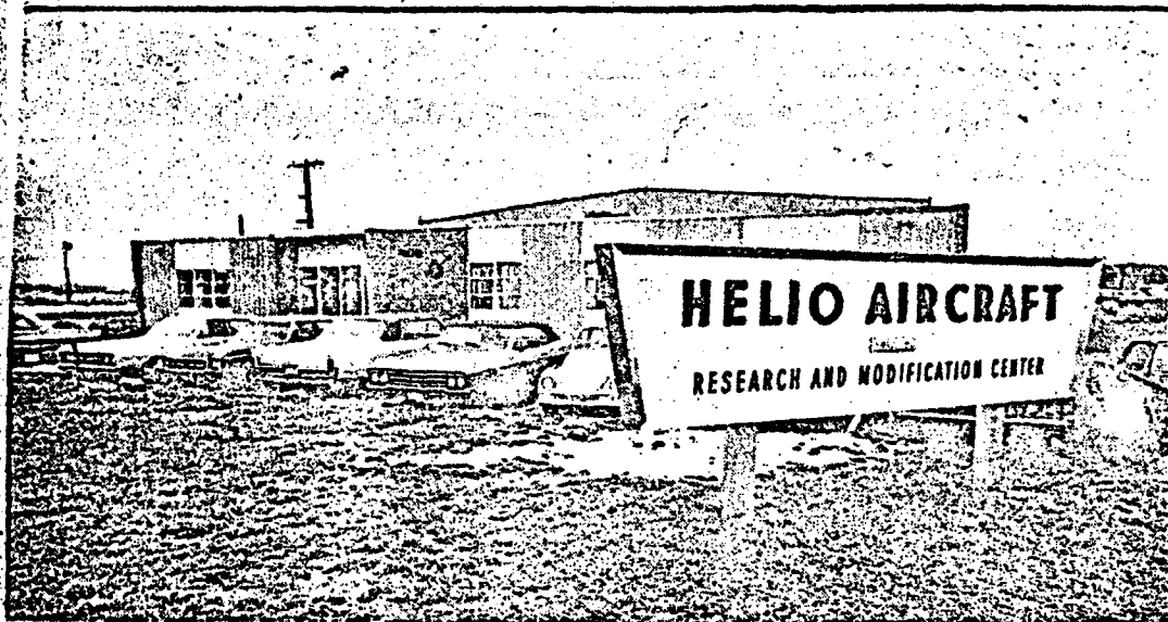
the home of the amazing plane: 'Sure we sell it to the CIA