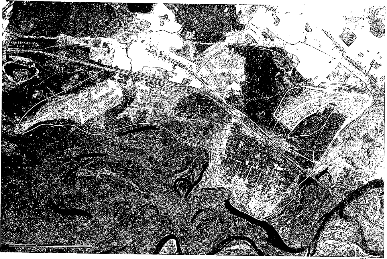
FIGURE 2. KOVROV TRAINING AREA WEST, KOVROV, USSR, JUNE 1964.