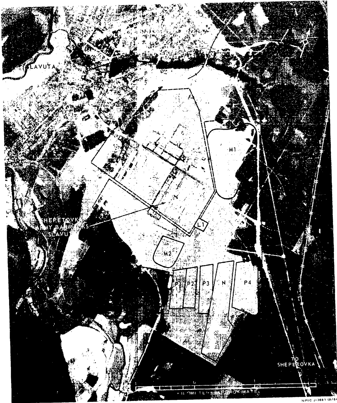
FIGURE 2. MILITARY TRAINING AREA, SLAVUTA, USSR, JUNE 1963.